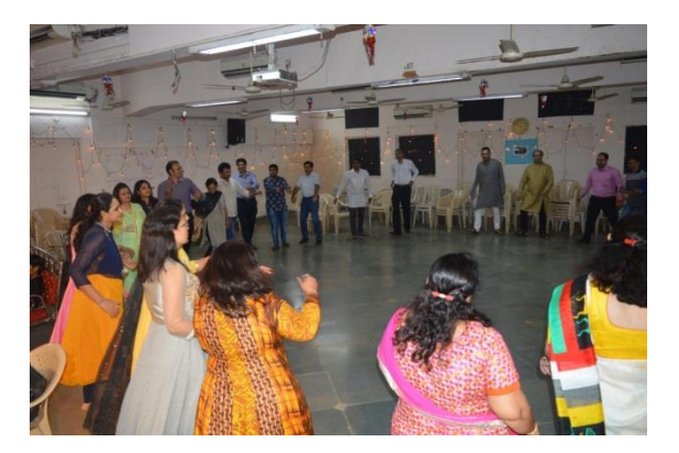
MCTC Members & their family enjoying Ye Shaam Mastani